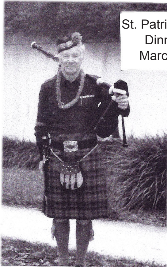
St. Patrick's Day Golf, Dinner Dance March 16, 1996